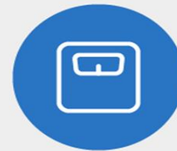
STAGE 4 Six and nine month one-to-one review