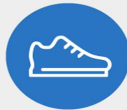
STAGE 2 Nutrition and physical activity sessions